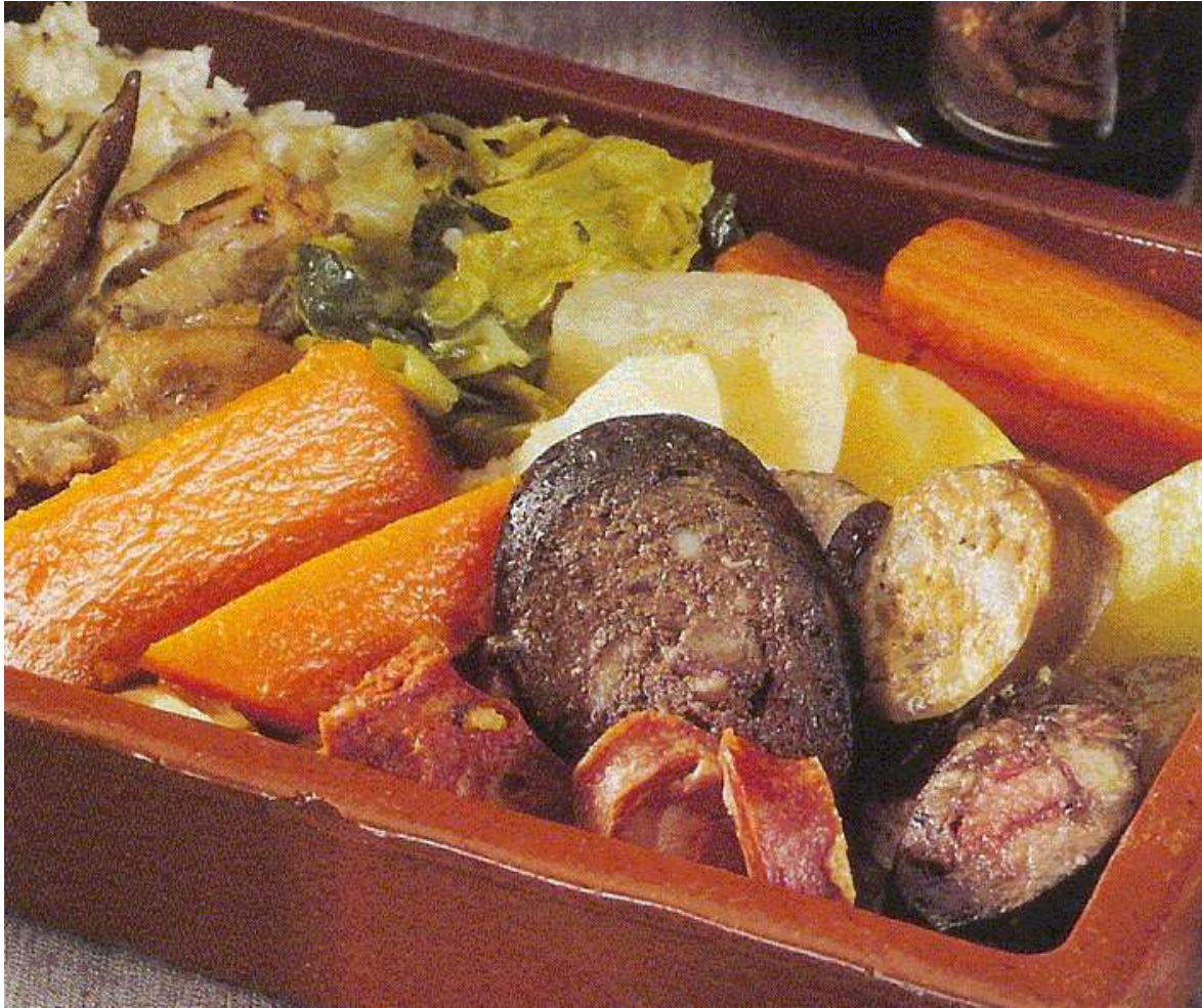
“Cozido à Portuguesa” (Portuguese “pot-au-feu”)