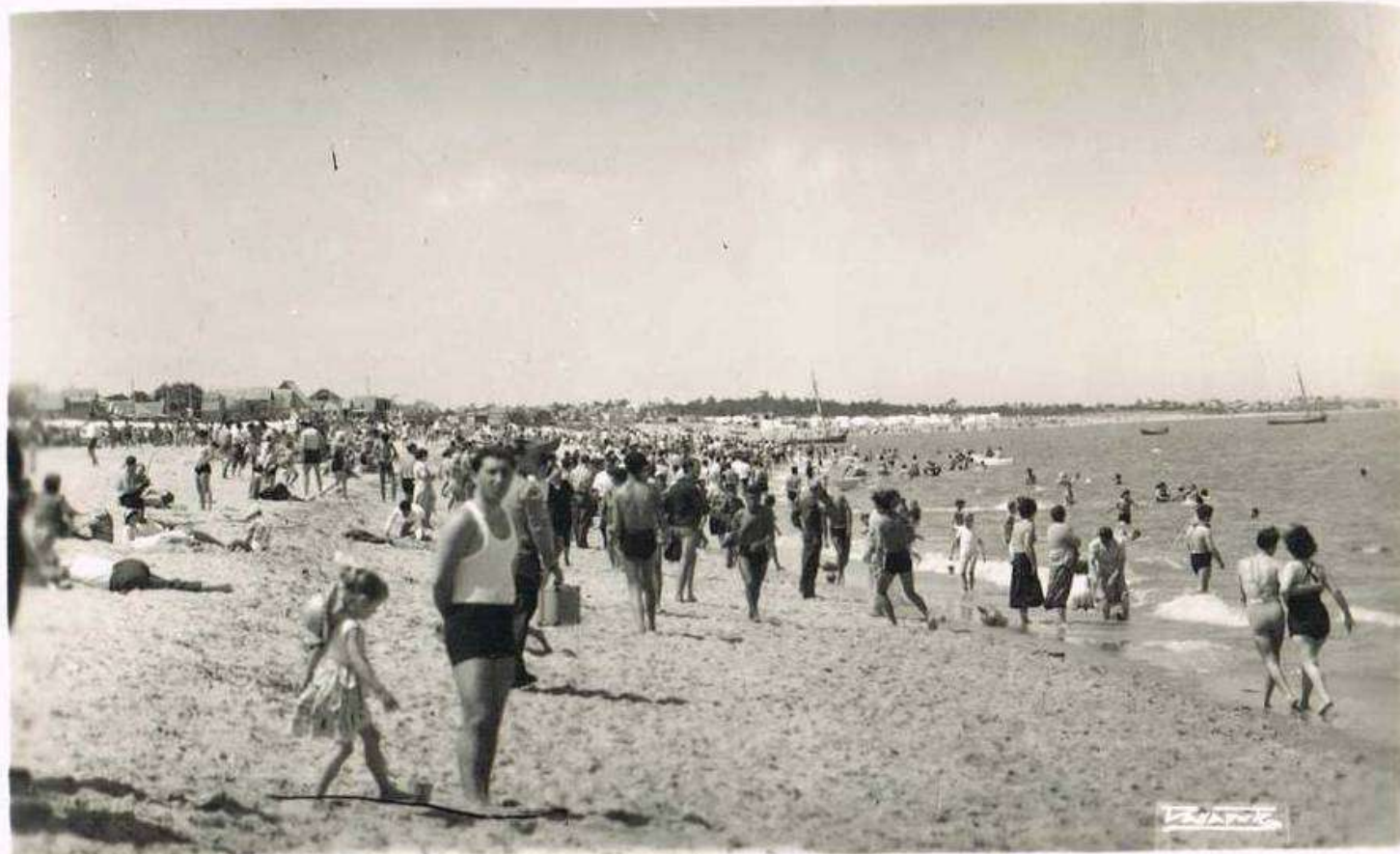
12 TRAFARIA - A Praia à hora do banho