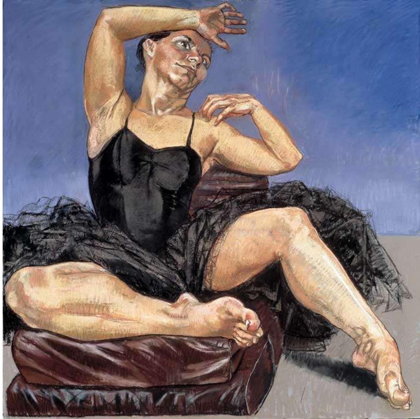
Dancing Ostriches, Paula Rêgo, 1995.