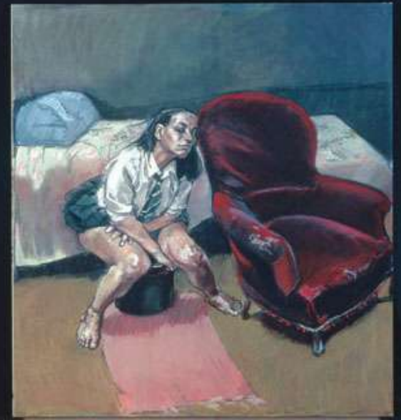
Triptych , Paula Rêgo, 1888.

Her work often gives a sinister edge to storybook imagery, emphasizing malicious domination or the subversion of natural order. She deals with social realities that are polemic, an example being her important Triptych (1998) on the subject of abortion, now in the collection of Abbot Hall Art Gallery in Kendal.