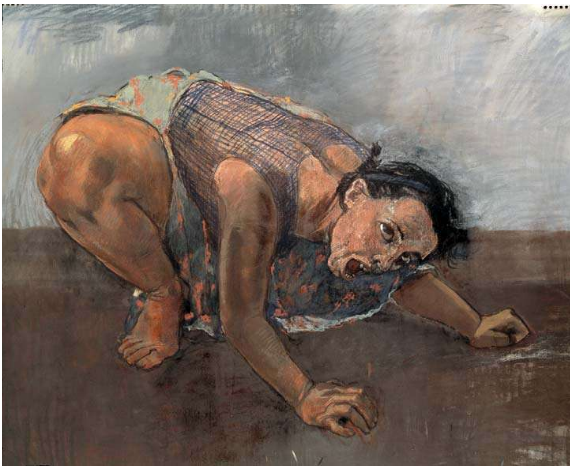
Dog Woman , Paula Rêgo, 1994.

Rêgo's style is often compared to cartoon illustration. As in cartoons, animals are often depicted in human roles and situations. Her later work adopts a more realistic style, but sometimes keeps the animal references — the Dog Woman series of the 1990s, for example, is a set of pastel pictures depicting women in a variety of dog-like poses (on all fours, baying at the moon, and so on).